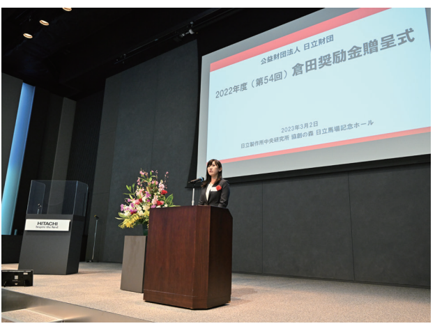
Speech by recipients' representative

Following the ceremony, a research briefing session was held at the same venue. Four representatives who have completed their research periods presented their research results.