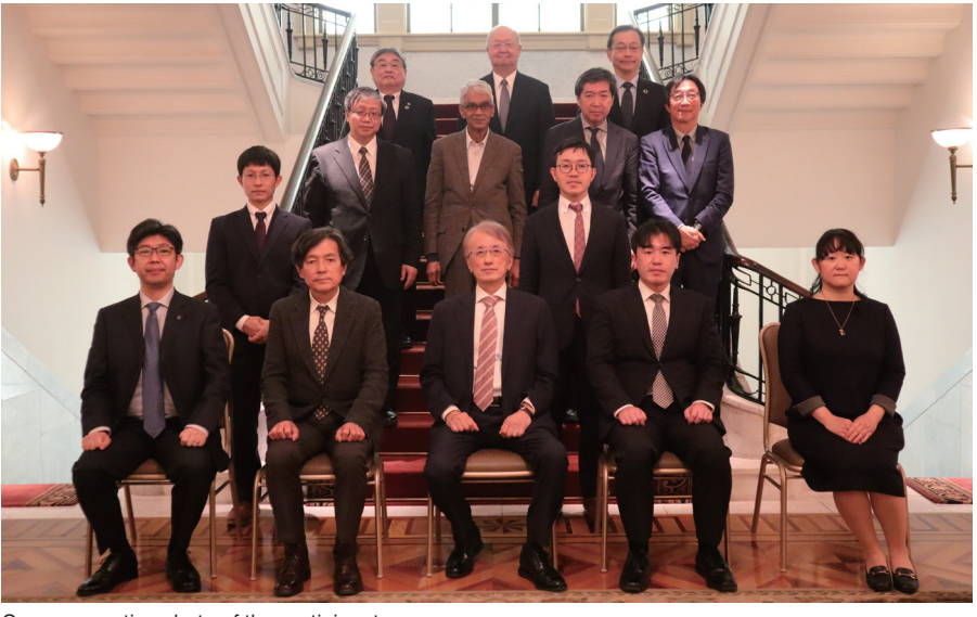
Commemorative photo of the participants

At the first interim report meeting, the representatives of each research project reported on the progress of their activities and future plans. The question-and-answer session that followed featured a lively discussion with the attendees, including members of the selection committee.